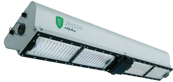
Picture Of Luminaire

Luminaire Manufacturer: Scynce LED Luminaire Model: Dragon Alpha Voltage: 277 volts Power: 650 watts Current: 2.35 amps Power Factor: 0.96 Frequency: 60Hz Ambient Temperature: 25 C Luminaire Temperature: 41.3 C